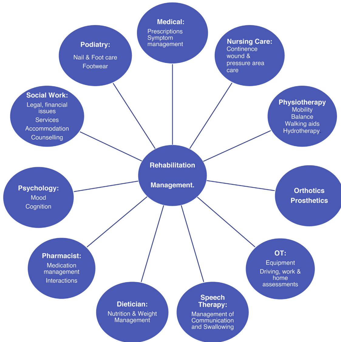
Fig. 3. Rehabilitation interventions. Illustrates various rehabilitation modalities. OT = occupational therapist.

management, psychological counseling, oral and swallowing exercises for head and neck malignancies, and pelvic floor exercises. Most prehabilitation occurs in an outpatient setting.